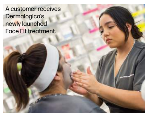
A customer receives Dermalogica's newly launched Face Fit treatment.