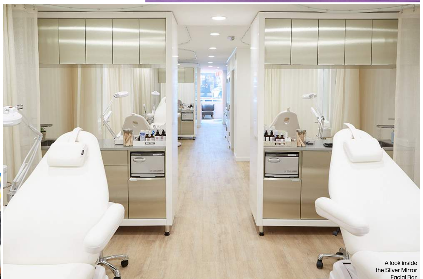
A look inside the Silver Mirror Facial Bar.