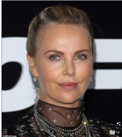
The perfect pout? One plastic surgeon told FEMAIL that actress Charlize Theron, 41, inspires his older clients (ages 40 and up), who prefer a natural and smooth look